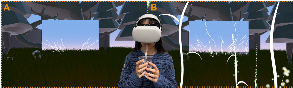
Figure 1: PlantSelf interaction. (A) The initial state where the user sees their plant avatar in a mirror within a calm VR environment. (B) After drinking water using the sensor-enabled straw, the virtual plant grows.